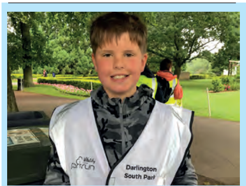
juniorparkrun - every Sunday, 9am, South Park. Free 2k run for ages four-14. To register visit www.parkrun.org.uk/ southpark-juniors

parkrun - every Saturday, 9am, South Park. Free 5k run. To register visit www. parkrun.rog.uk/darlingtonsouthpark