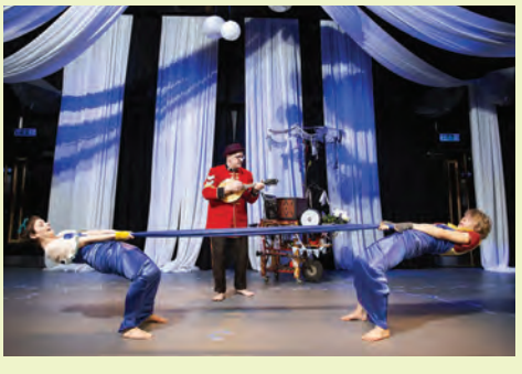
Five – Wednesday 23 – Saturday 26, various times , Theatre Hullabaloo. Dance and musical performance for three-six year olds.

Vegan food festival, Saturday 19 , town centre.