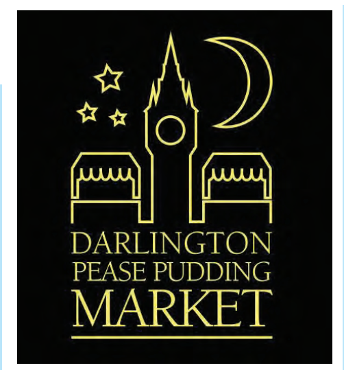
Pease Pudding night market – first Thursday of every month, 4-9pm, town centre.

North Eastern Railway cottage homes 100th anniversary exhibition - Saturday 7 to Sunday 1 December, Head of Steam. Normal entrance fee.