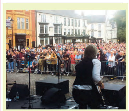
Rhythm & Blues Festival – Sunday 15, 1-5.30pm, Market Square and Riverside Park. Details see Darlington R&B club Facebook page.

NERA exhibition – trains, boats and planes (and other railway activities) – Tuesday 3 to Sunday 13 October, Head of Steam. Normal entrance fee.